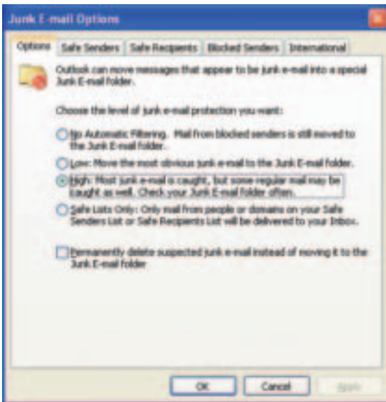
Figure 3. Enable junk e-mail filtering in Office Outlook 2003.

To set junk e-mail options in Office Outlook 2003, use these steps: