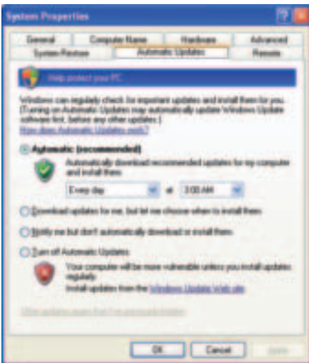
Figure 2. Set up your computer to download and install updates automatically.

You can also keep current with security updates for Microsoft Office. These updates and other downloadable add-ins are available by going to the Office Update website ( http://office.microsoft.com ) and clicking Check for Updates .